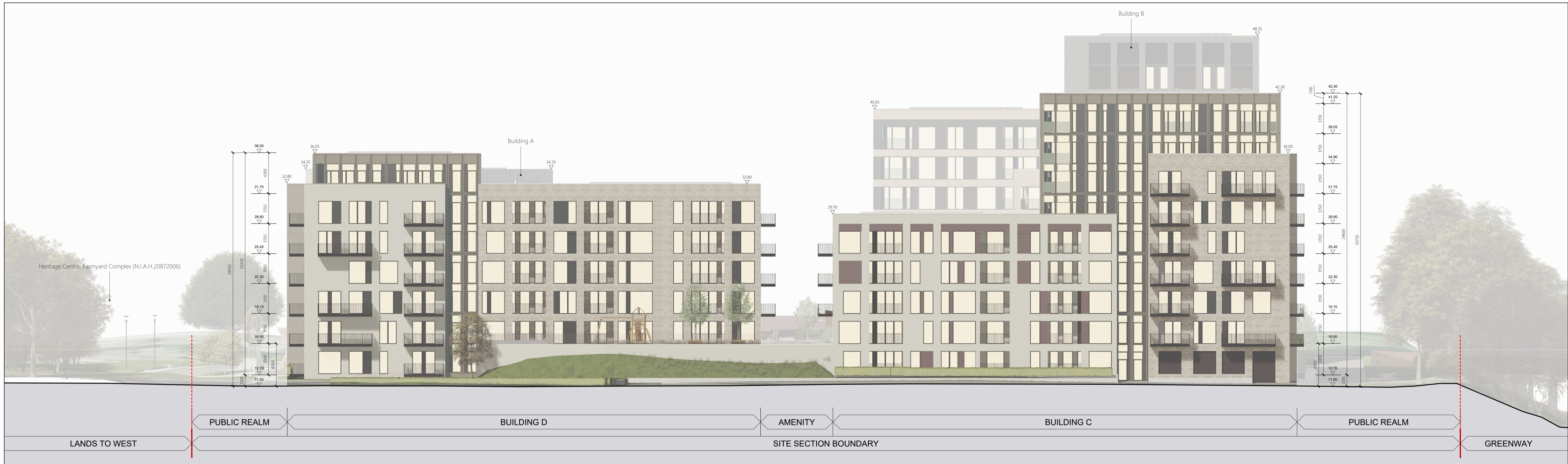
1 SOUTH SITE ELEVATION K4 SCALE 1:200