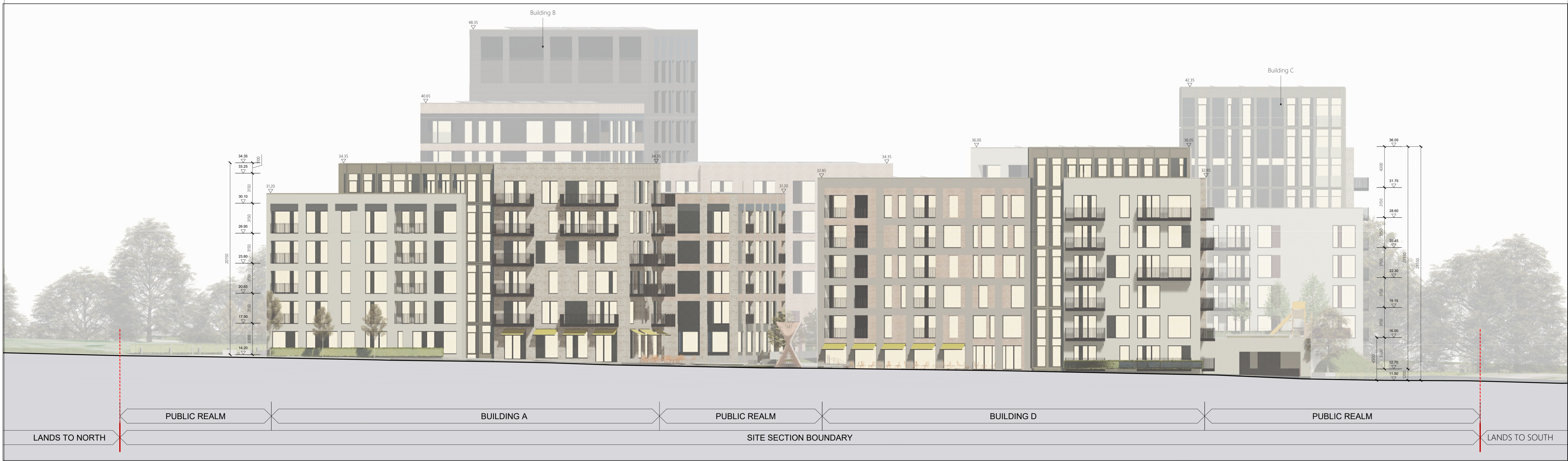
2 WEST SITE ELEVATION K3 SCALE 1:200